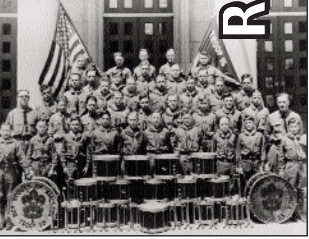
Racine Scouts, 1927.

In 1930, the Scouts distinguished themselves and their city by winning the prestigious "Chicagoland Music Festival." The corps program grew to be so