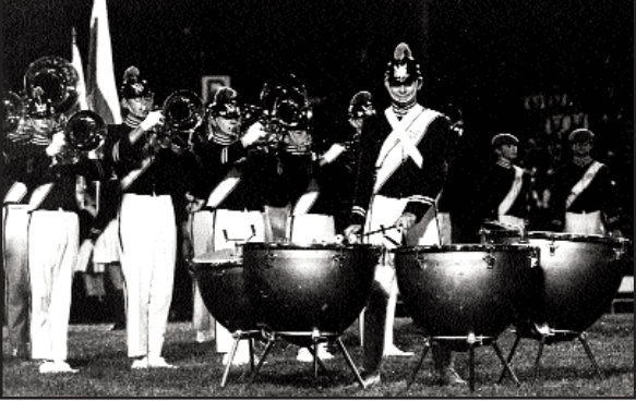
Racine Scouts, 1972.

attended 1971 VFW Nationals in Dallas, TX. On the way there, the corps stopped off in Kansas for Mid-American Open and came within two-tenths of a perfect marching and maneuvering score.