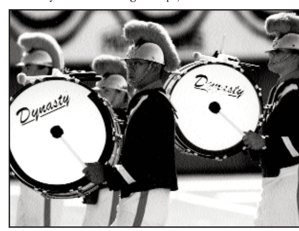
(Above) Racine Scouts, 2001.

We look forward to having you read about how successful those plans have been in "A History of Drum & Bugle Corps, Volume 3!"